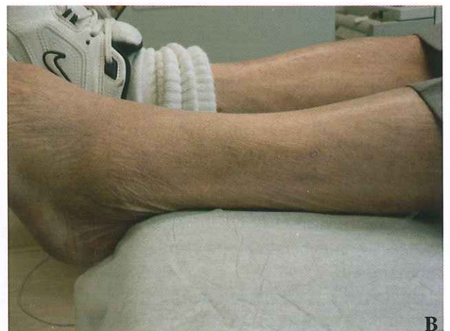
Figure 5. The left leg of a patient with psoriasis before (A) and after (B) treatment with UVB phototherapy.