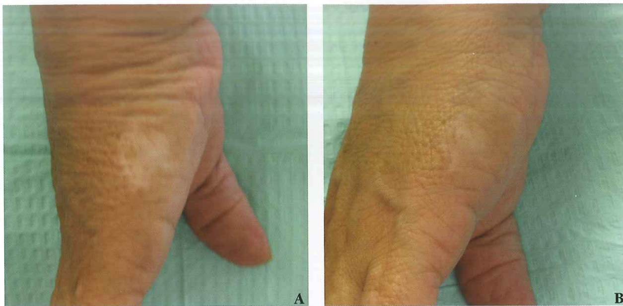
Figure 3. The left hand of a patient with vitiligo before (A) and during (B) treatment with UVB phototherapy.

address isolated tough areas. If the problem areas are localized to begin with, treatment can begin immediately with the handheld broadband UV module of the laser system.