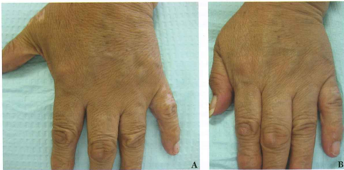
Figure 2. The left hand of a patient with vitiligo before (A) and during (B) treatment with UVB phototherapy.

room, and were expensive to use. The Harmony XL is one laser platform with a modular design, which consists of a base unit and an assortment of handheld modules that attach interchangeably for a variety of different clinical and aesthetic applications.