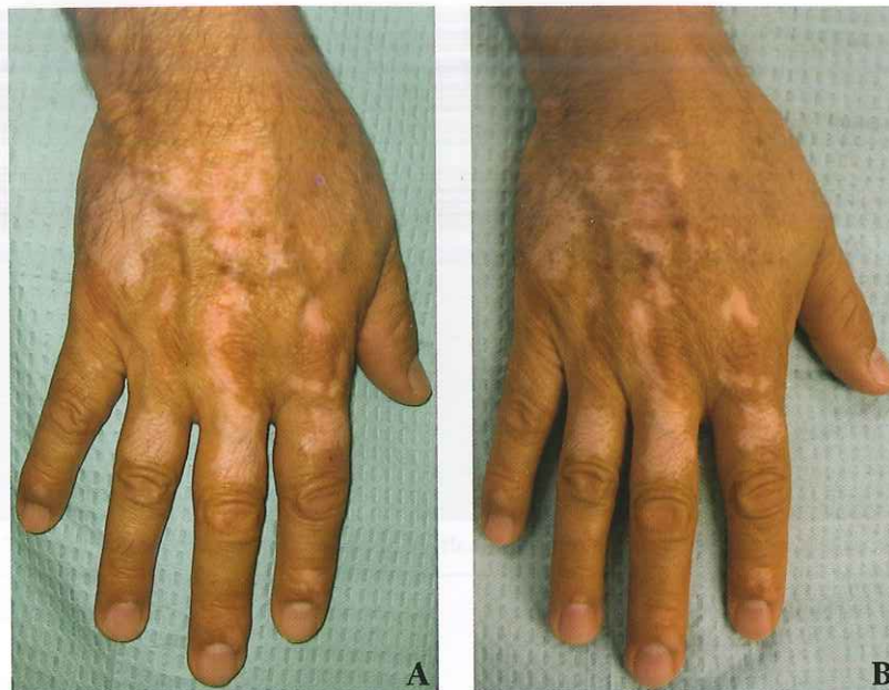
Figure 4. The right hand of a patient with vitiligo before (A) and after (B) 6 treatment sessions with UVB phototherapy.

Treatment of affected skin in patients with psoriasis should overlap the healthy skin at the periphery of the treated site by no more than one or 2 millimeters. With the broadband UV hand piece module for use with the Harmony XL platform, precision adjustments can be made in fluence between 200 to 1000 mJ/cm 2 in 10 mJ/cm 2 increments, and set the pulse duration for 30, 40, or 50 milliseconds. The light beam can pinpoint a treatment area (spot size) as small as 6.4 cm 2 . If a smaller treatment area is required, several round and square templates are available to reduce the treatment area.