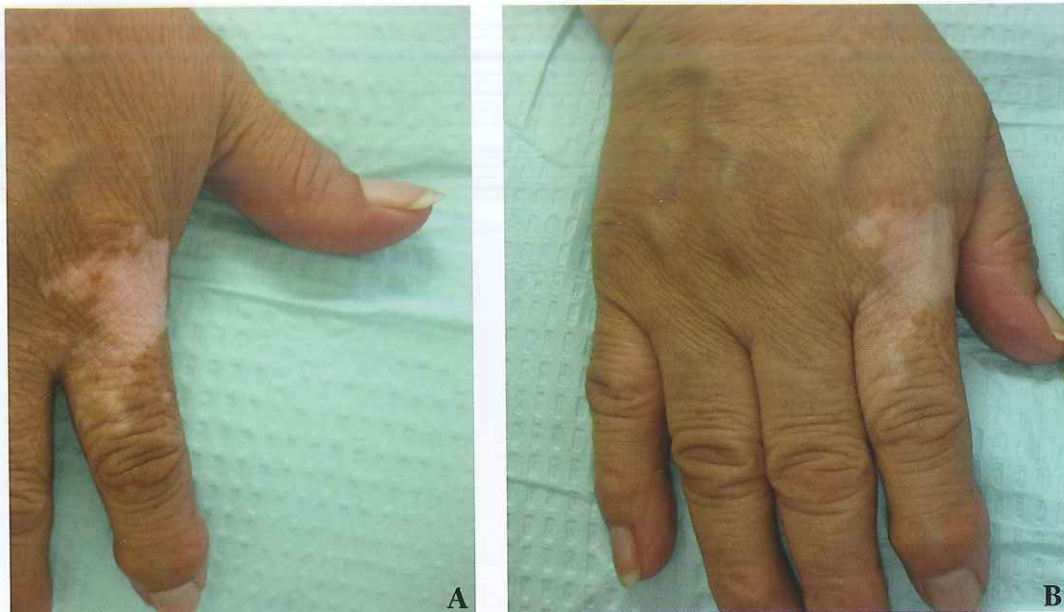
Figure 1. The right hand of a patient with vitiligo before (A) and during (B) treatment with UVB phototherapy.